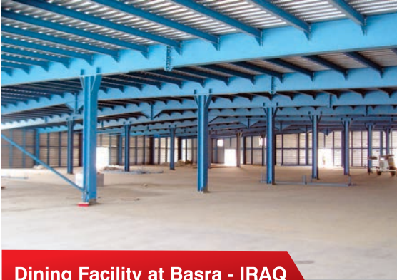
Dining Facility at Basra - IRAQ