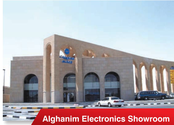
Alghanim Electronics Showroom