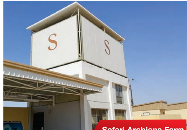
Safari Arabians Farm