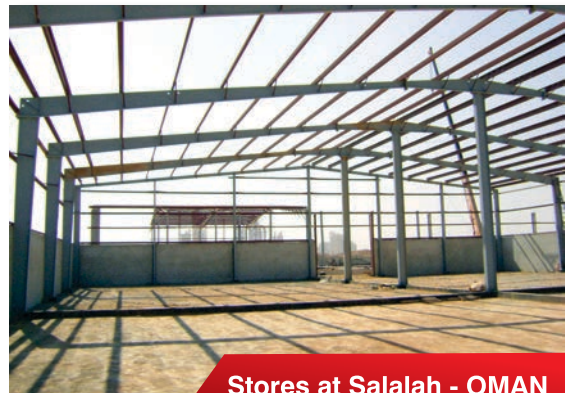
Stores at Salalah - OMAN