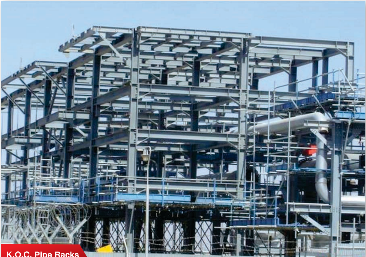
K.O.C. Pipe Racks