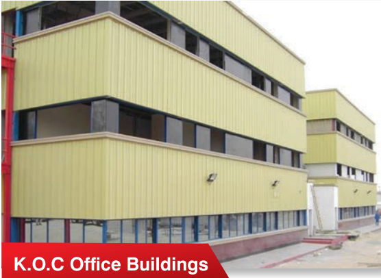
K.O.C Office Buildings