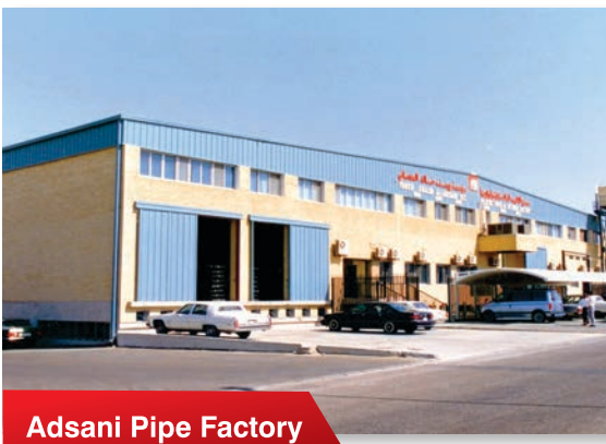
Adsani Pipe Factory