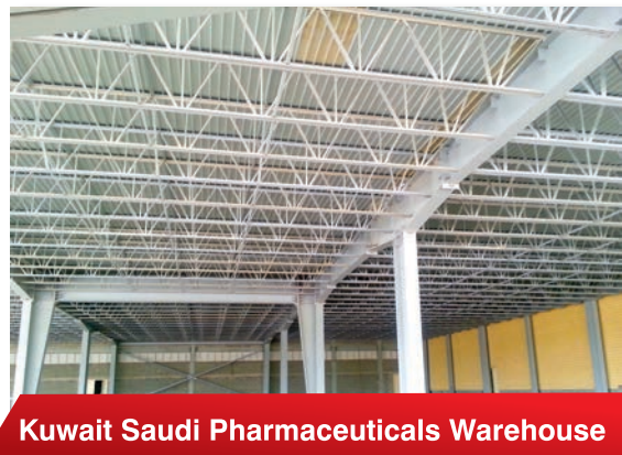
Kuwait Saudi Pharmaceuticals Warehouse