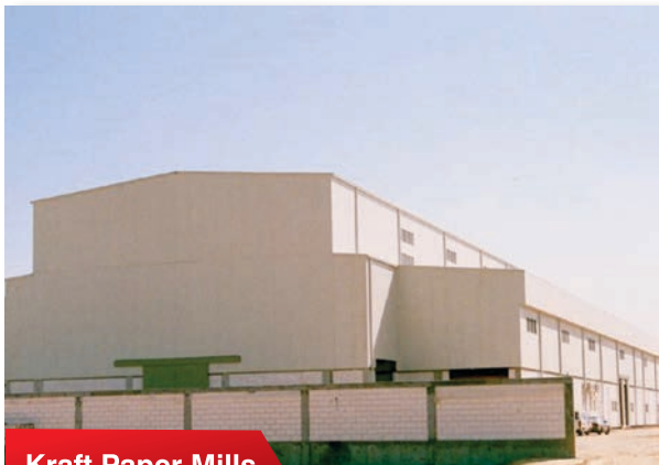
Kraft Paper Mills