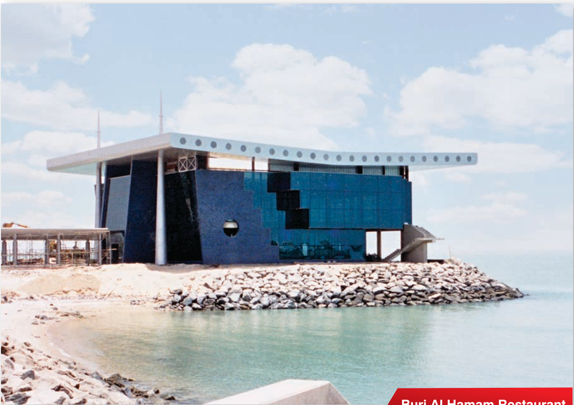
Burj Al Hamam Restaurant