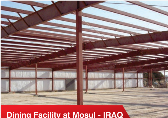
Dining Facility at Mosul - IRAQ