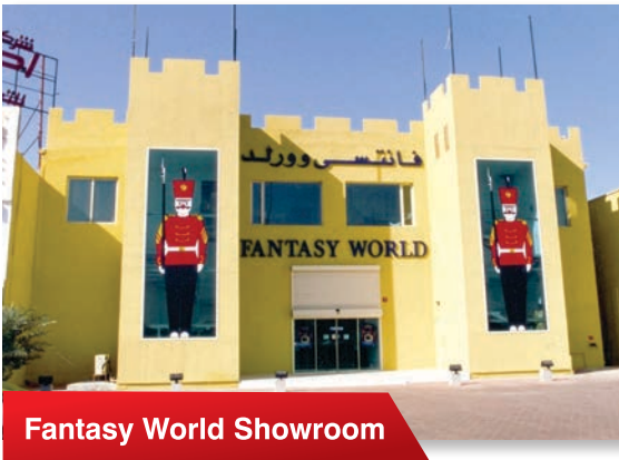
Fantasy World Showroom