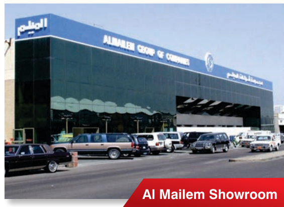
Al Mailem Showroom