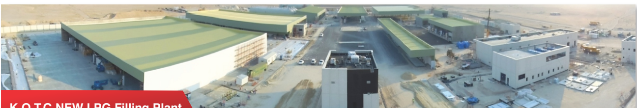
K.O.T.C NEW LPG Filling Plant