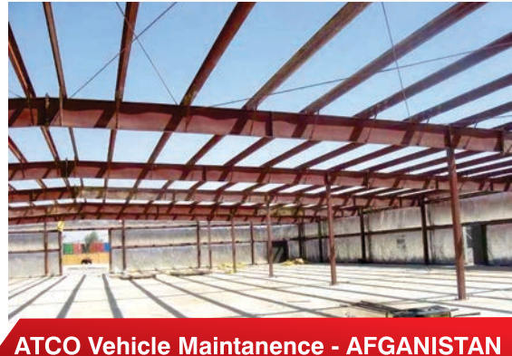
ATCO Vehicle Maintenance - AFGANISTAN