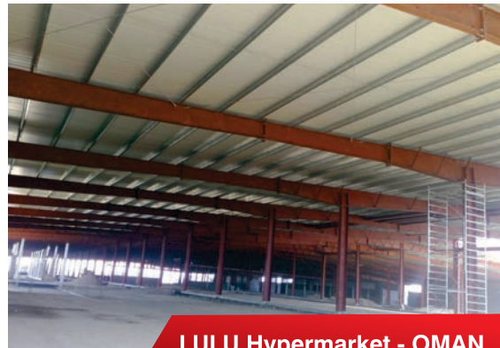
LULU Hypermarket - OMAN