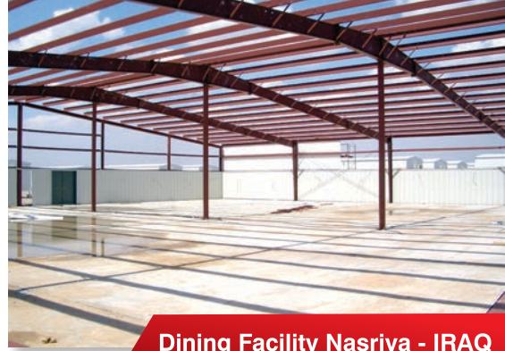
Dining Facility Nasriya - IRAQ