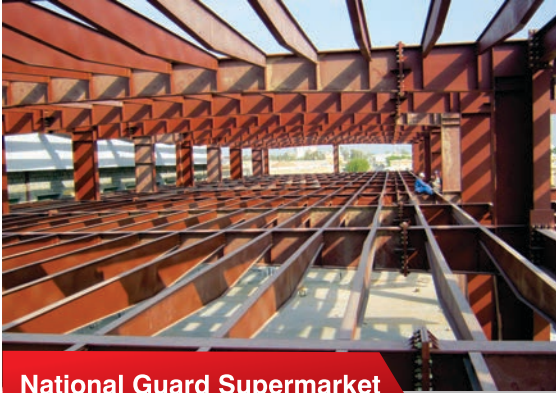
National Guard Supermarket