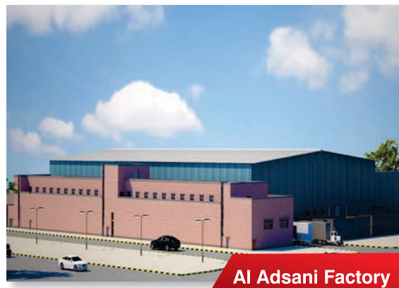
Al Adsani Factory