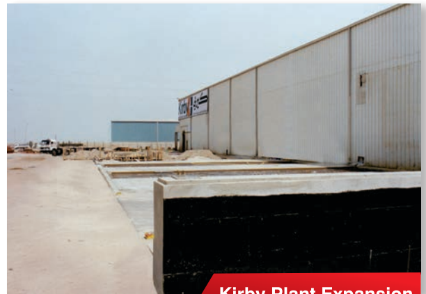
Kirby Plant Expansion