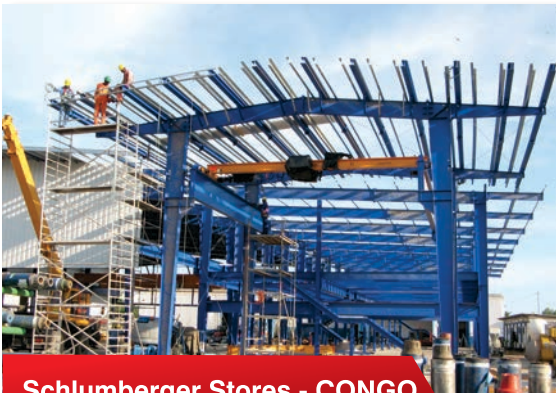
Schlumberger Stores - CONGO