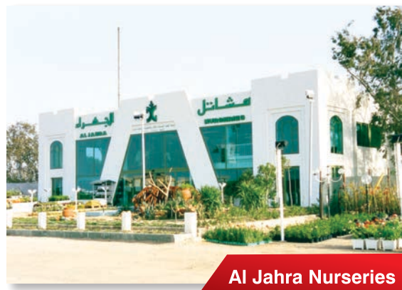
Al Jahra Nurseries