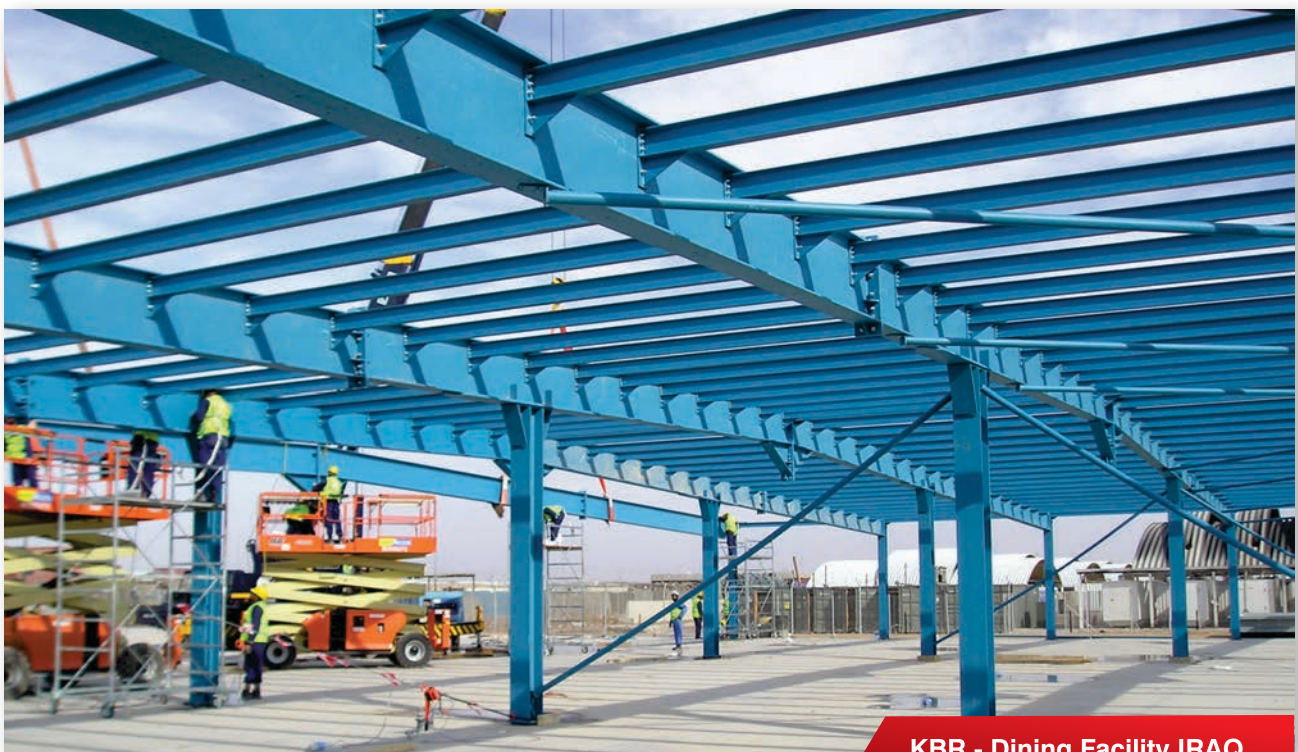
KBR - Dining Facility IRAQ