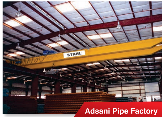
Adsani Pipe Factory