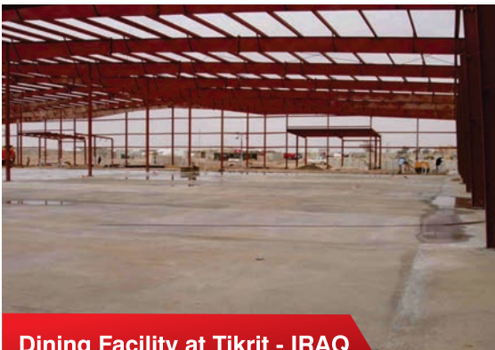
Dining Facility at Tikrit - IRAQ