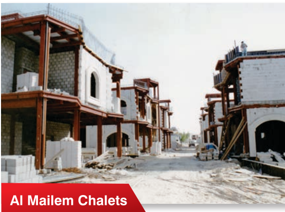
Al Mailem Chalets