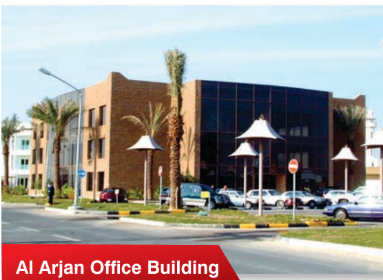
Al Arjan Office Building