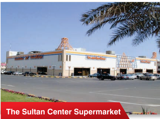
The Sultan Center Supermarket