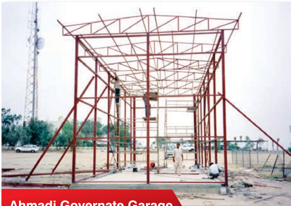
Ahmadi Governate Garage