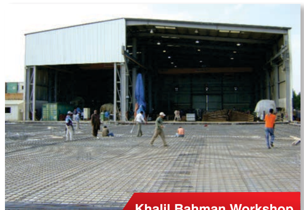
Khalil Bahman Workshop